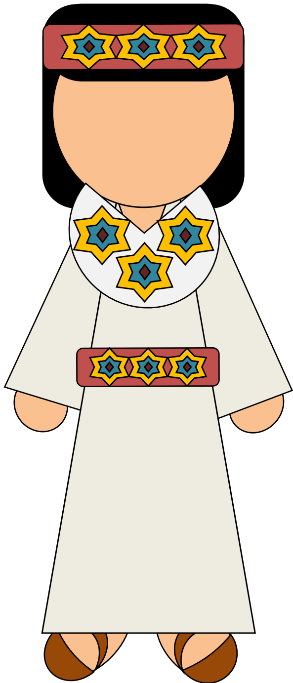
Joseph In Egypt

SEE LESSON 14-16 FOR OTHER POPSICLE STICK FIGURES