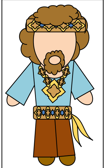
Concentration game Copy two pages on card stock, cut, laminate, cut and play the matching game