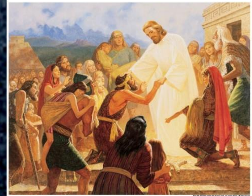
The Scriptural Testimonies of the Miracles of Jesus and His Apostles (vs. 18)