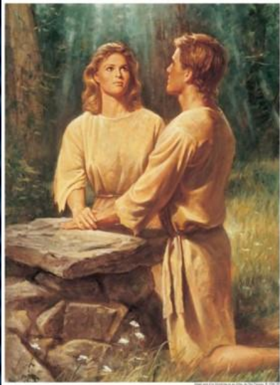
The Creation of Man (vs. 17)

Moroni Speaks to Those Who Say That God Is Not a God of Miracles