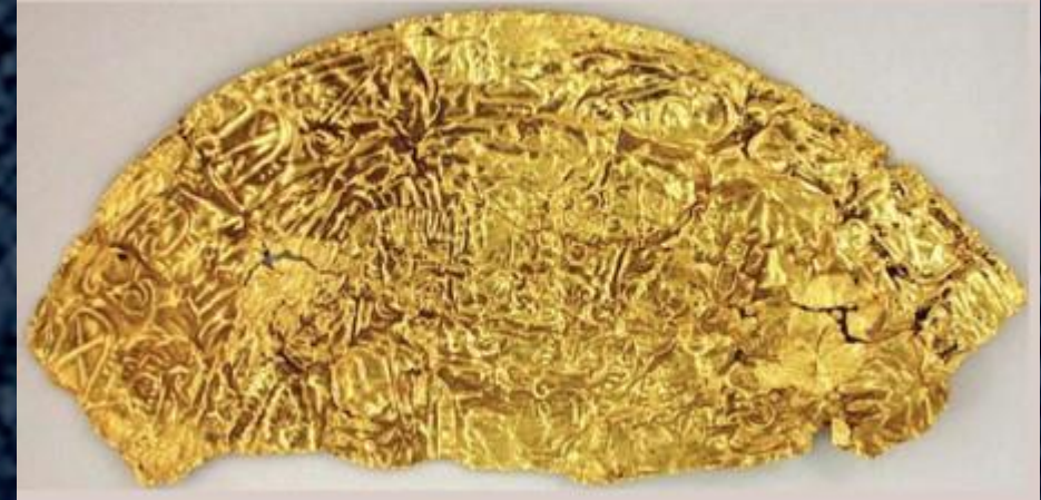
Peabody Museum 10-71-20/C10049, an actual example of hieroglyphic writing on a golden plate.

Concerning the script of the plates of Mormon, Moroni says: ' ... We have written this record according to our knowledge, in the characters which are called among us the reformed Egyptian, being handed down and altered by us, according to our manner of speech.' (Mormon 9:32.)