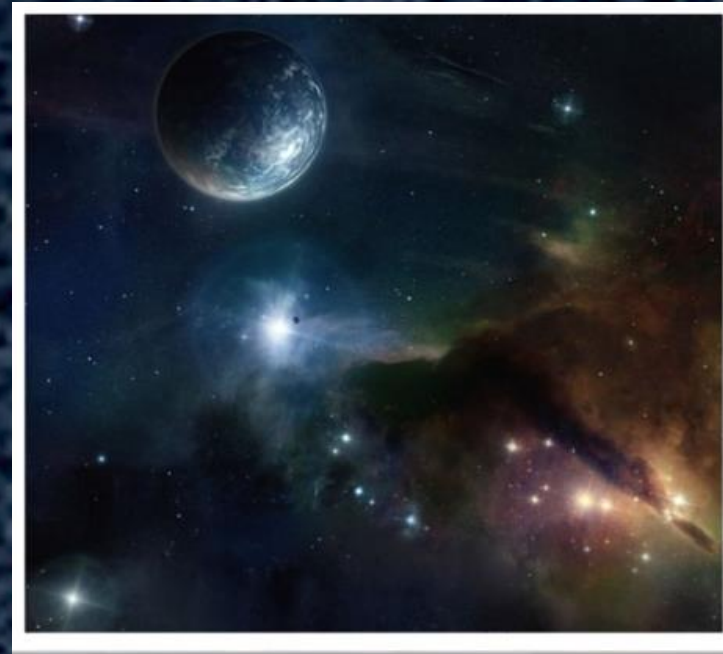
The Creation of Heaven and Earth (vs. 17)