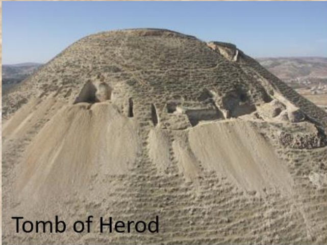
Tomb of Herod

Long after Herod's death, the work of enlargement and ornamentation was continued. It had been 46 years in construction.