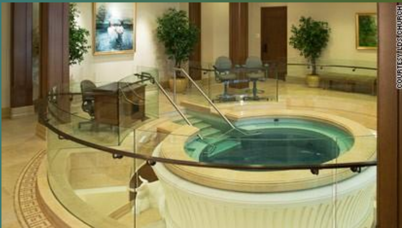
Kansas City Temple Baptismal Font

Vicarious ordinances become effective only when the deceased persons accept them in the spirit world and honor the related covenants.