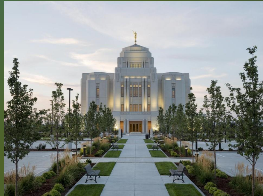
Meridian Idaho Temple

In the temple, these saving ordinances can also be performed vicariously for the dead.