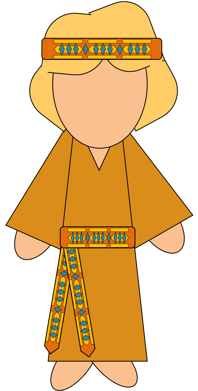
Esau and Jacob