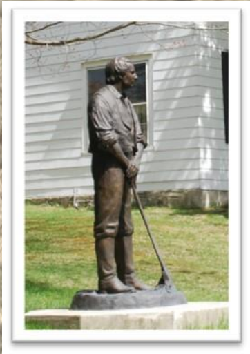
Joseph Smith –History 1:55-56

What things are you prepared for if something happens different than what you expected?